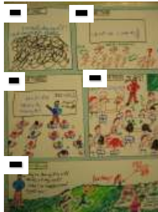
Figure 5. Example of Set 2 drawing: Uncertainty (gradual improvement)

Emotionally supportive classroom. In 57 entries, participants expressed that they would emotionally support their students' learning. These drawings and descriptions clearly indicated teachers' efforts to encourage students as shown in statements and exclamations such as: "You can do it"; "There is no stupid question!"; "Go explore, you can do it"; and "My door is always open for questions." Smiling faces on both teachers and students appeared frequently in the drawings, as well. There were 23 entries that described close physical distance between the teacher and student (e.g., a teacher sitting at a round table with students, the teacher and students holding hands). In 45 entries, students' were shown making positive comments about mathematics and the teachers were identified (e.g., students saying "I am never frustrated in this math class", "We love our math teachers", "Math is fun", and "Math rocks".)