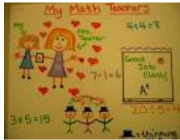
Figure 1. Example of Set 1 drawing: Positive past math experiences

Mixed experiences. Eighteen entries contained both positive and negative experiences. These drawings and written descriptions illustrated participants' mixed emotions about their math teachers or the subject matter. For example, one entry was divided into two sections: one part has a sun and smiling faces, while the other part has clouds and lightning. Its written description states that the picture portrays two different sides of her teacher: very warm, funny, and helpful and at the same time very strict and moody (see Figure 2-a). The other entries in this category were divided into three subcategories: (1) Overall, I enjoyed math but did not like the way my teachers taught, (2) Overall, my teachers were great, but I did not like math, and (3) I had different experiences grade by grade; generally, positive experiences in the early grades, negative experiences in later grades (see Figure 2-b).