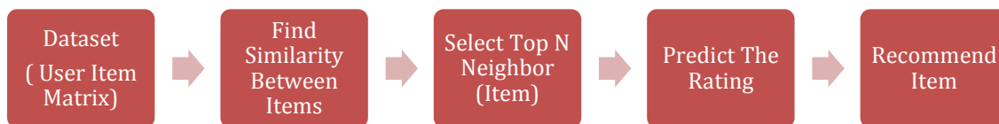
Figure 2. Recommendation Process

Based on this predictive rating, the system considered to recommend it to user or not. The higher the predictive rating leads to the greater the chance that the item will be recommended to a user. In general the recommendation process that use item-based collaborative filtering approach can be depicted in Figure 2 [7]. This research followed this process.