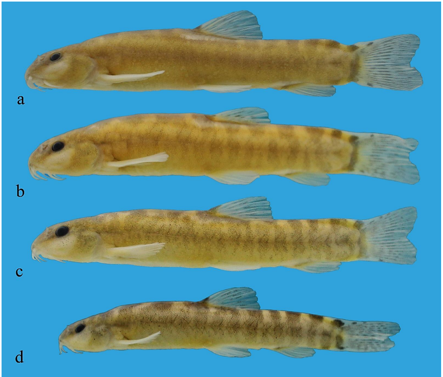
Figure 2. Paraschistura ilamensis , VMFC PSI3-P, paratype; Iran: spring Siahgav; a, 42 mm SL; b, 42 mm SL; c, 41 mm SL; and d, 34 mm SL.

Caudal fin emarginate with round lobes. Very-small scales scattered on all over body. Moveable protuberance at the antero-ventral corner of the eye in males.