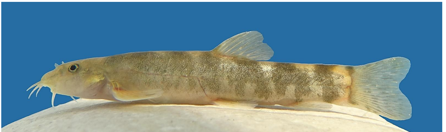
Figure 4. Paraschistura ilamensis , VMFC PSI3-P, paratype; 41 mm SL; Iran: spring Siahgav.