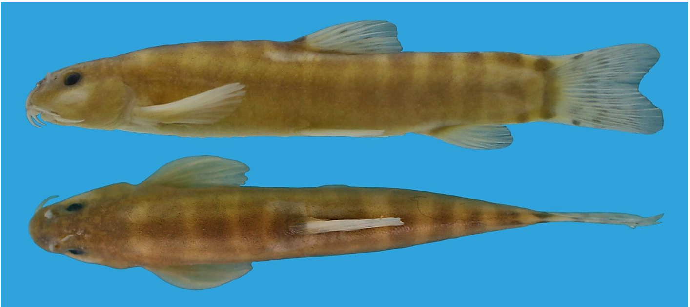
Figure 1. Paraschistura ilamensis , VMFC PSI3-H, holotype, 43 mm SL; Iran: spring Siahgav.

in 5% buffered formaldehyde after anaesthesia, and stored in 72% ethanol. Morphometric characters were measured by a dial caliper to the nearest 0.1 mm. All measurements are made point to point, never by projections. Methods for counts and morphometric measurements were performed based on Kottelat and Freyhof (2007). Standard length (SL) is measured from the tip of the snout to the end of the hypural complex. The length of the caudal peduncle is measured from behind the base of the last anal-fin ray to the end of the hypural complex, at mid-height of the caudal-fin base. The last two branched rays articulating on a single pterygiophore in the dorsal and anal fins are noted as "1½".