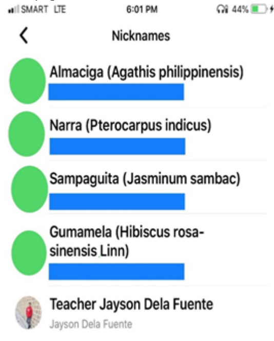
Figure 1 Facebook Messenger chat group interface and homepage

who are mainstreamed together with the thirty-nine (39) normal students in a regular classroom.