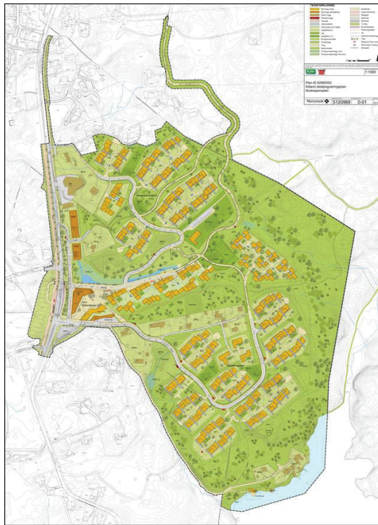
Figure 2: Illustration plan for Zero Village Bergen*

i.e. the actors' interactions are seen along the three axes: (1) informal-formal, (2) for profit-non-profit and (3) public-private. Similar to the quadruple helix, actors are structured in four actor categories; 1. State; 2. Market; 3. Community; 4. Third sector, which universities/academia belong to. A rationale behind the choice of MaP is its deep attention to the role and power of the university as a social entrepreneurial and cooperative organization, conceptualizing an intermediary between the three others [8]. In this model, sectors are not fixed entities, indeed the boundaries between them are contested, blurring, shifting and permeable [8]. In addition, an actor can be a person, organization, or a collective of persons and organizations, which is able to act [8, 9].