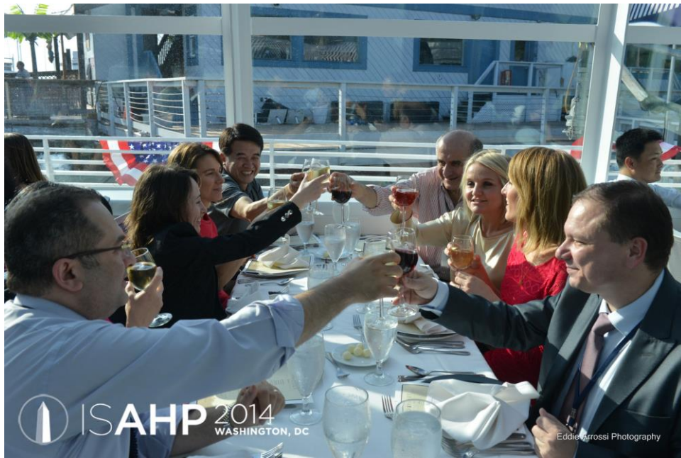
A toast during the Gala dinner