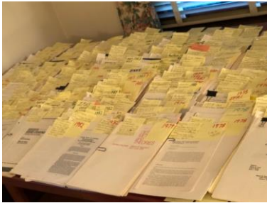
Collection of Tom's papers