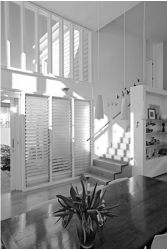
Top: Architect G. Tarrant, Photographer P. Reynolds. Bottom: Architect B. Hulena, Photographer T. Eyre (Home NZ October/November 2008).