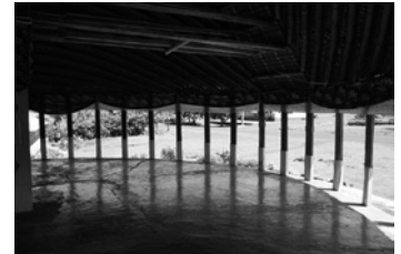
Faletele interiors and exterior, Salelologa, Savaii, Samoa Nuku-Te-Apiapi, Whakarewarewa