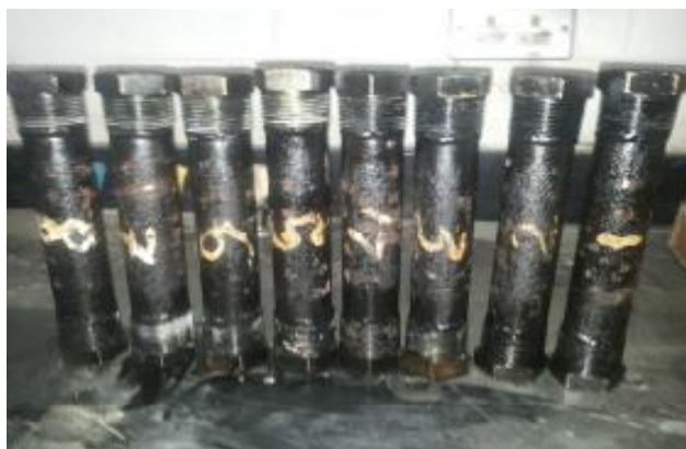
Fig. 3. Core holder of the fluid injection system