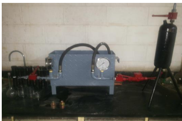
Fig. 2. Fluid injection system