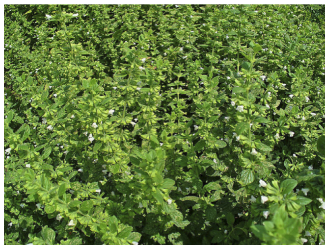
Fig. 1: Melissa officinalis L.

Fresh herbs contain phenolic compounds, L-ascorbic acid, carotenoids, flavonoids and terpenoids. Lemon balm leaves are rich in flavonoids (0.5 % dry weight) consist of quercitrin (a derivative of quercetin), ramnocitrin, luteolin and its derivatives (luteolin 7- O - \beta -D-glucuronopyranoside, luteolin 3'- O - \beta -D-glucuronopyranoside, apigenin 7- O - \beta -D-glucopyranoside, and luteolin 7- O - \beta -D-glucopyranoside-3'- O - \beta -D-glucuronopyranoside). The major components among terpenoids are neral, geranyl acetate, ursolic acid and tannins (MORADKHANI et al., 2010; MIRAJ et al., 2017). 0.087 g/100 g of caffeic acid and 21.15 g/100 g of rosmarinic acid were detected in