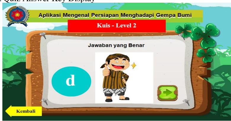
Fig 15. Display Explanation of Level 2 Quiz Answers