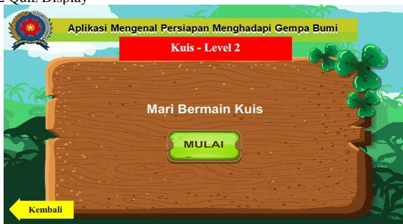
Fig 13. Level 2 Quiz Display