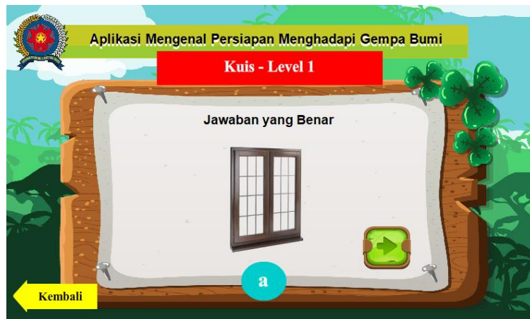
Fig 11. Level 1 Quiz Answer Key Display