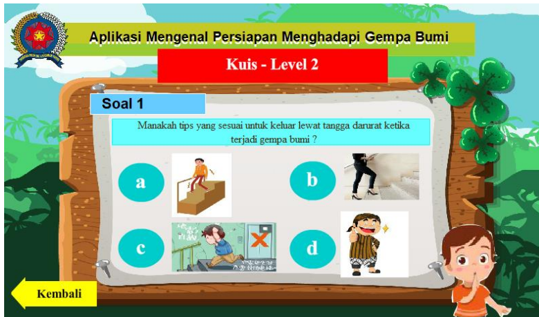
Fig 14. Level 2 Quiz Question Display