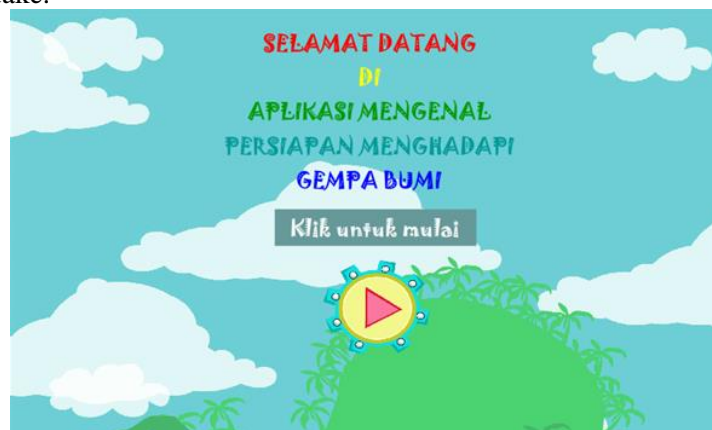
Fig 3. Intro View

The intro view is used as a display that appears after the loading process is complete. This loading display is used for a brief explanation of the application regarding preparation for an earthquake.