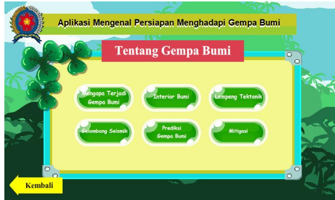
Fig 5. Menu Display About Earthquake

The menu display about earthquakes serves to go to the menu display about earthquakes.