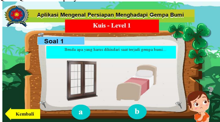
Figure 10. Level 1 Quiz Question Display