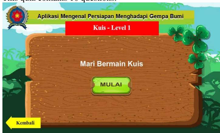
Fig 9. Level 1 Quiz Display

Quiz view serves to go to the quiz menu view. This quiz is divided into two levels, level 1 and 2. This quiz contains 10 questions.