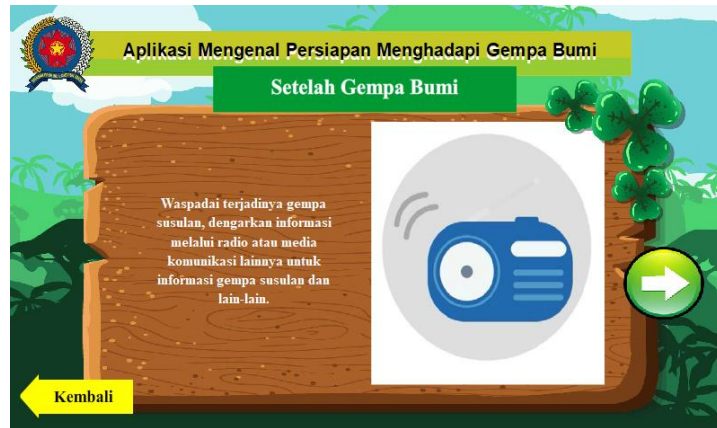
Fig 8. Menu Display After Earthquake

The menu display after the earthquake serves to go to the menu display after the earthquake.