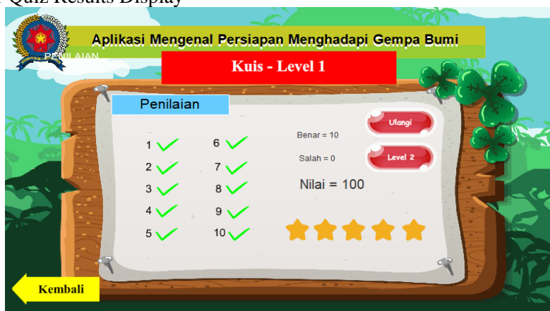
Fig 12. Level 1 Quiz Results Display