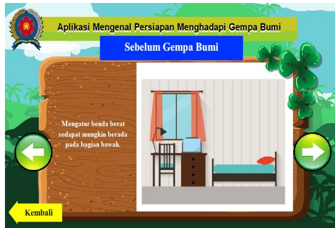
Fig 6. Menu Display Before Earthquake

The menu display before the earthquake serves to go to the menu display before the earthquake.