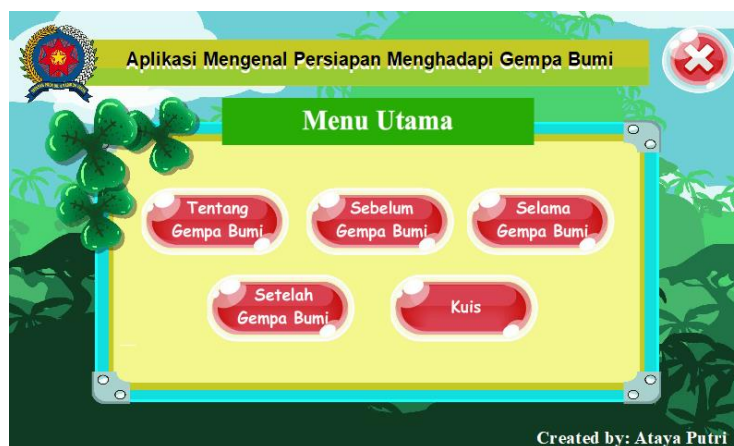
Fig 4. Main Menu Display

The main menu display is a display that contains the main menu, namely, a menu about earthquakes, before, during and after earthquakes and quizzes.