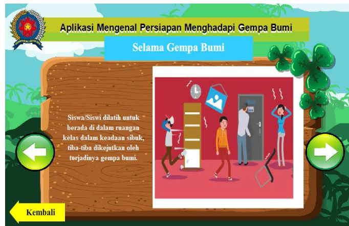
Fig 7. Menu Display During Earthquake

The menu view during an earthquake serves to go to the menu view during an earthquake.