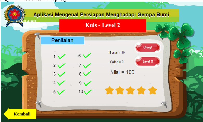
Fig 16. Level 2 Quiz Results Display