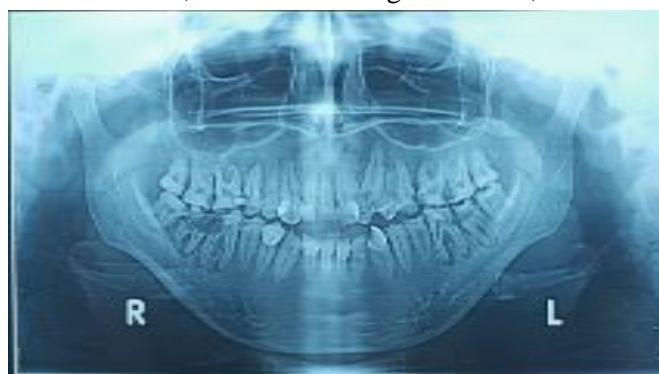
Figure 1: Orthopantomogram

Radiographic findings: Figure no.1 is showing Orthopantomogram (OPG) on which it was found that tooth #46 #47 (Federation Dentire International Classification of teeth) were grossly carious and were not in a condition to be saved anymore as their furcation were involved with minimal coronal tooth structure left, as shown in Fig 2. Hence, she was