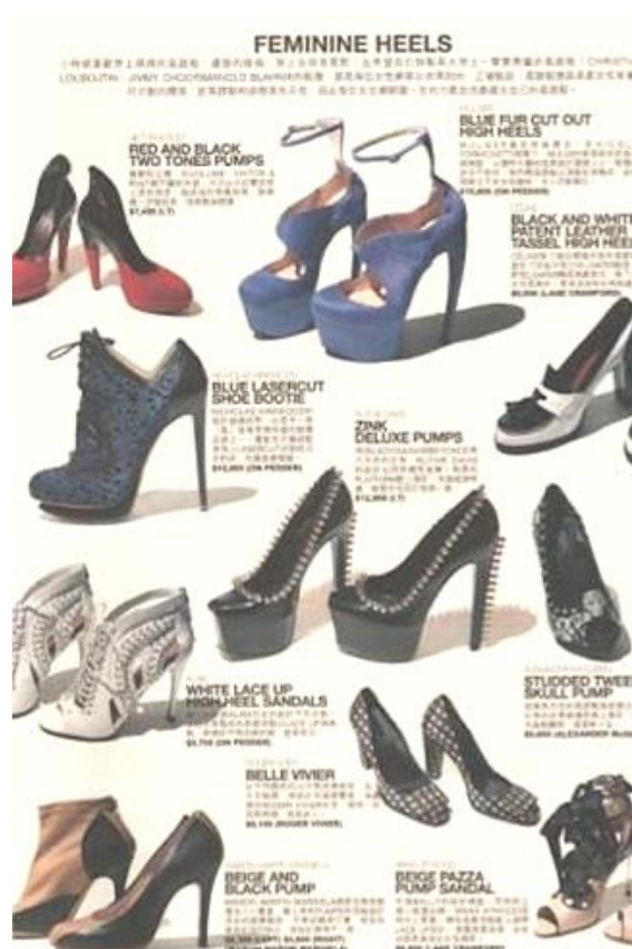
Figure 2. Example of Kris’s product styling. Red-lacquered soles of Christian Louboutin and other branded high heels.