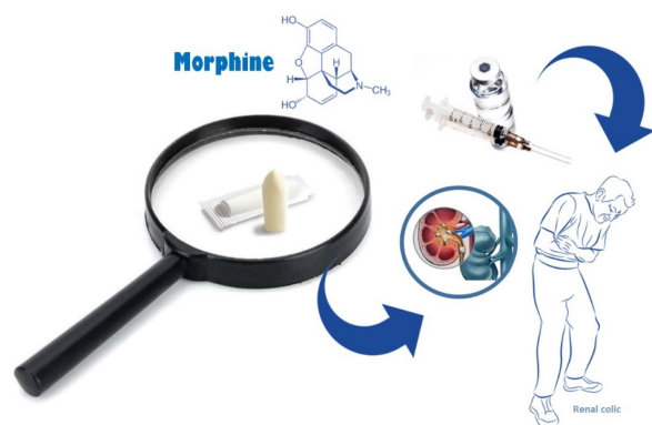
Fig. 3 The schematic summary of the study.