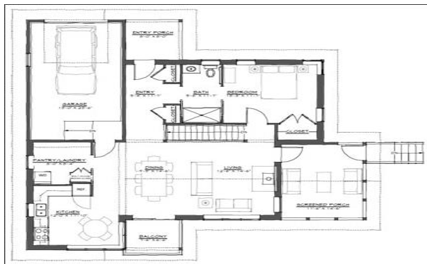
Figure 2. The Community Building, Upper Floor.

Nestled into the hillside will be 17 south-facing houses in two clusters. The lower cluster of 12 three-quarter-acre lots will comprise Phase I along Crosier Lane; Phase II the upper five-lot cluster along Stowe Farm Lane. Between the two clusters is the existing house, a large redwood home built in 1972 with five guest rooms, a large party or meeting space, kitchen, library, and workshop. This building will serve, at least for the time being, as the community house.