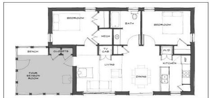
Figure 4. Mini House Floor Plan.

Second (lower floor): The lower floor has two guest bedrooms, one of which might be used for an office, and a bath. At the rear, there is a large storage and utilities room. For those who might need it, this floor could also be used as separate living space for a caregiver.