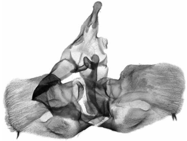
Figure 2. Isotrias penedana sp. n., male genitalia.