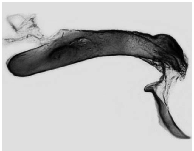
Figure 6. Isotrias penedana sp. n., male genitalia. Aedeagus.