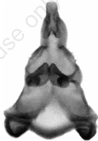
Figure 4. Isotrias penedana sp. n., male genitalia. Tegumen frontally.