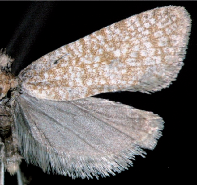
Figure 1. Isotrias penedana sp. n., adult.