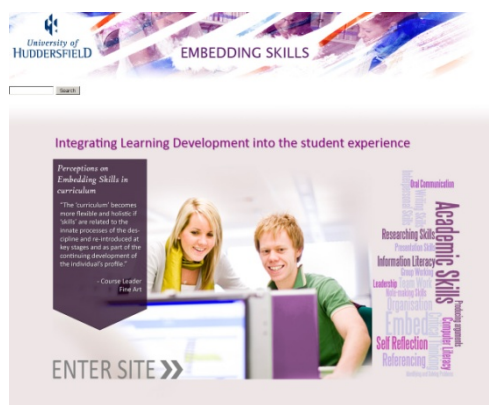
Figure 1. Home page.

The project discovered many examples of innovative practice which integrate the teaching and learning of skills within the curriculum and it is these case studies that form the basis of the project's newly developed website http://embeddingskills.hud.ac.uk (see Figure 1).