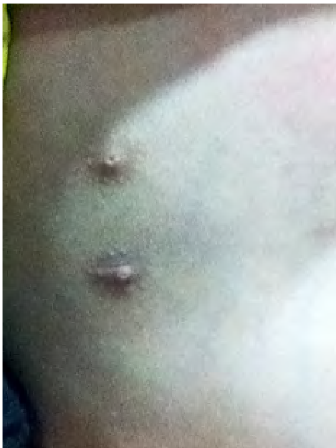
Figure 1: supernumerary nipple on the right side.