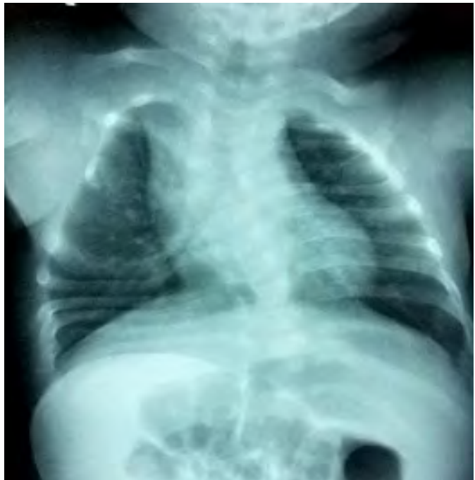
Figure 2: Chest radiology showing deformation at the second, fourth, and fifth rib and the scoliosis.

There was no consanguinity between the parents. The father was 26 years old and the mother was 22. The patient's birth history were uneventful. He was the second child of the family, first pregnancy was aborted at 1½ months period of gestation due to young age of mother, seven years back. On physical examination, the child had normal facies, supernumerary nipple on the right side (Figure 1), normal left nipple, scoliosis and lumbosacral prominence. Extremities were normal. Urogenital and rectal examinations were also normal. Chest radiology revealed deformation at the second, fourth and fifth ribs and agenesis of the third rib (Figure 2). Ultrasonogram of abdomen and pelvis revealed both kidneys towards the left side with other viscera within the normal location. Complete blood count, renal function test and liver function test were within normal limits. A karyotype of 46, XY was detected. Cardiac findings were normal and so was the cranial MRI. MRI and CT images reveal crossed renal ectopia (Figure 3), lumbar spina bifida with lipomyelocele and diastematomyelia (Figure 4).