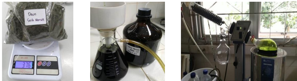
Figure 4. 2 weighing, giving ethanol dan rotary evaporator