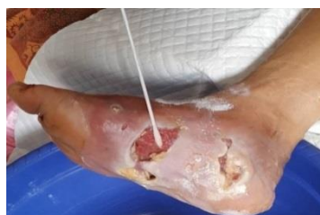
Figure 4. 4 Swab of wound

The swab is taking specimens in the area to be examined. Several types of swabs, such as simple techniques, z-stroke techniques, and Levine swab techniques, were often used because they have a high sensitivity reaching 52.9% ( Beta Subakti Nata'atmadja, 2013 ). Levine's technique is more reflective than others. The method carried out using a swab rotation with a slight pressure on the wound area of 1 cm 2 of granulation tissue to remove the exudate for 5 seconds. ( Baranoski & Ayello, 2015 )