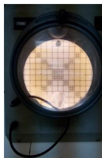
Figure 4.5 Plate count bacterial

The measurement of bacterial was used by the Total Plate Numbers (Eka Wisnu Kusuma, 2019). The examination of bacterial numbers by the total plate count method (Plate Count Total / PCT) carried at the UPTD health laboratory in East Kalimantan Province. The calculation of bacterial cells in the cup used in units of CFU / ml. CFU stands for Colony Forming Unit, which means colony forming units or units.