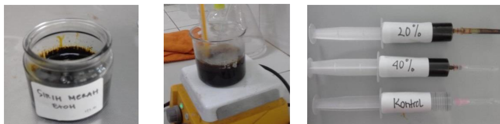
Figure 4.3 Delusion extract process