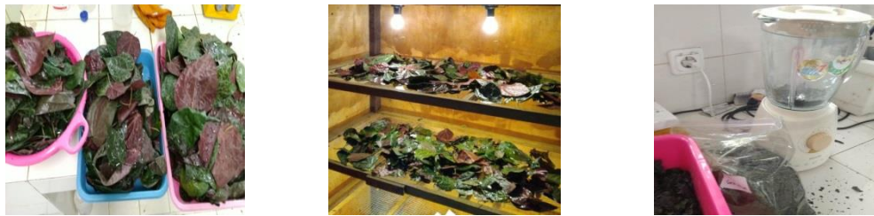
Figure 4. 1 washing, then dried, sliced, blanded