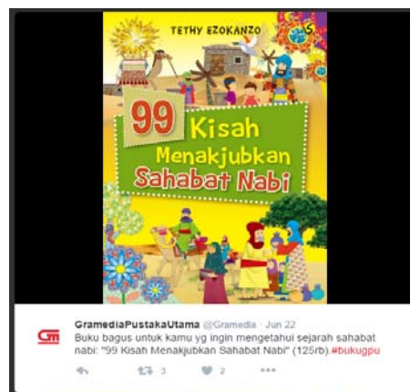
Figure 2 Children's Book of Gramedia Pustaka Utama

The third stage is designing message. In developing an effective message, it is delivered by the publisher through Twitter and Facebook. Social media must contain elements of AIDA (Attention, Interest, Desire, Action), which has gained the consumers attention by giving the message and display the latest preview pictures of the children's book edition. It could raise a sense of interest to children's books products by consumers. By posting the latest children's books, it stimulates the consumer's desire to buy children's books with preview story, replacing the book cover or the book preface thus finally do the purchasing (action). The example of children's books in one publisher (Gramedia) can be seen in Figure 2.