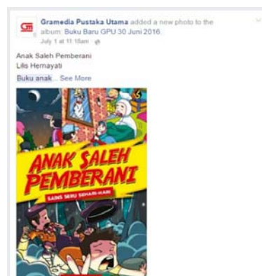
Figure 4 Facebook Promotion at Gamedia Pustaka Utama

The second technique is Humanistic approach technique. This technique is using more humane approach technique. In this technique, the purchasing decision is left entirely to the consumers. Publishers are simply providing various types of children's books such as activities book, story books, and coloring book. It provides information about the benefits and the goodness that available on each product. It can be seen in Figure 4.