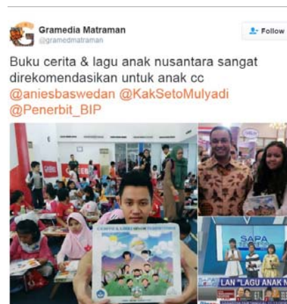
Figure1 Facebook Gramedia Pustaka Utama

Kotler and Keller have defined that marketing communications as the medium used by companies to inform, persuade, and remind consumers directly or indirectly about the products and brands they sell. In a certain sense, marketing communications represent the brand's "voice" and as a medium that can be used to initiate a dialogue and building relationships with consumers. The description of the stages that proposed by Kotler & Keller (2009) are first stages, identify in message recipient target. Identification target of the message recipient from children book is the parents' work as the decision maker in purchasing children's books. The social media as the tool in promoting book, especially in children books can be seen in Figure 1.