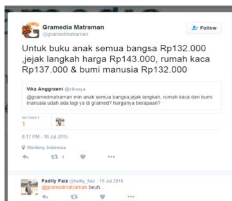
Figure 3 Twitter of Gamedia Matraman