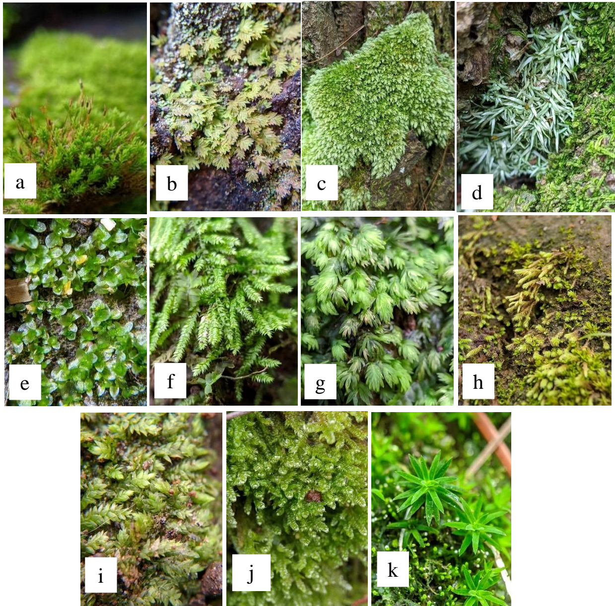
Figure 3. Leaf mosses (Bryophyta) were found in the Senggani Ravine tourism area. a. Barbulla indica b. Fissidens purpusillus c. Fissidens biformis , d. Octoblepharum albidum , e. Rhizonium punctatum , f. Mnium stellare , g. Mnium hornum , h. Philonotis marchica , i. Fontinalis antipyretica , j. Hypnum cupressiforme , k. Polytrichastrum formosum