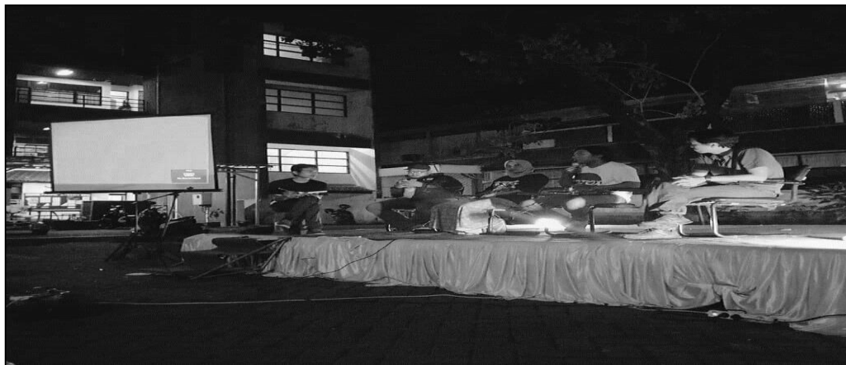
Figure 5. Pendowo Bangkit Campaign in University

Lakardowo Village. Activities to fill out seminars or discussions conducted by Pendowo Bangkit also endeavor to recruit supporters from academia and students who join in their activities to seek justice for the right to a healthy environment. (Figure 5)