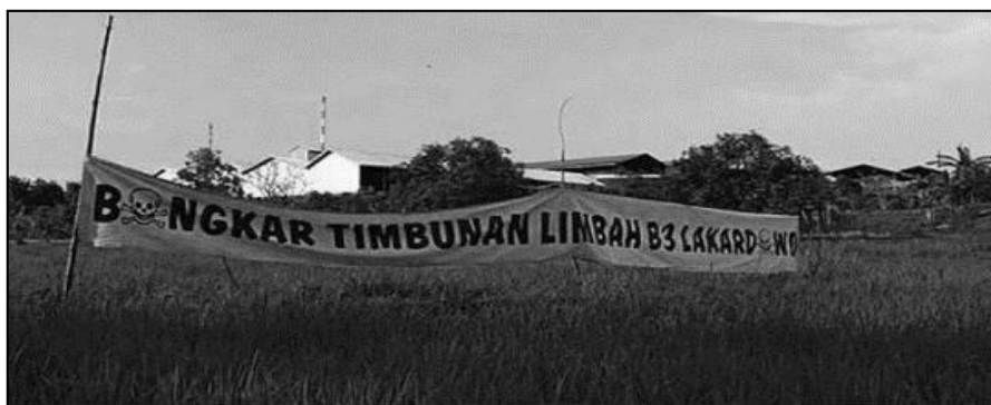
Figure 3. Pendowo Bangkit Campaign

Various methods have been taken so that the problem of hazardous and toxic waste in Lakardowo Village can be immediately completed and freed from the threat of hazardous and toxic waste because since the last four years the residents of Lakardowo Village have been harmed by the hazardous and toxic waste processing plant activities. Because of this issue, some children in the village have dermatitis due to the use of well water polluted by waste. Meanwhile, the company refused to process the identification of environmental pollution. Indeed, the use of campaigns in social, printed, and electronic media is also used by Pendowo Bangkit. It is aimed at creating an injustice frame felt by the community of Lakardowo Village from the environmental permit of the hazardous and toxic waste company. As for the documentation from the campaign carried out by Pendowo Bangkit to form joint awareness of the villagers about the dangers of hazardous and toxic waste in Lakardowo is as follows. (Figure 3)