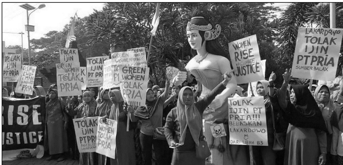
Figure 4. Mobilization of Lakardowo Village

The use of mass mobilization to conduct demonstrations is widely used by several parties or groups that carry out policy advocacy. It is also shown in research conducted by Rahardian & Haryanti (2018) which in the research findings revealed demonstrations of several labor groups in Surakarta in rejecting wage policies. The latest research conducted by Wong (2016) also found several protests conducted by residents of Guangzhou, China in the case of anti-incinerator. Reflecting from previous research and theories, it also confirms that policy advocacy is identical to a social movement or mobilization of a period. To achieve the expected policy changes, mass mobilization becomes essential in the series of advocacy. It is because to get the attention of policymakers and implementers, it requires the appointment of a problem that is felt to be really important starting from the lower levels. The documentation of the activities in mobilizing the mass of Lakardowo village in protesting the environmental permit and the existence of the industry can be seen in the picture below (Figure 4).