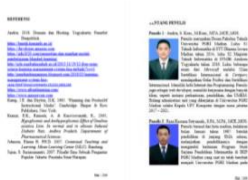
Figure 3. Postliminaries