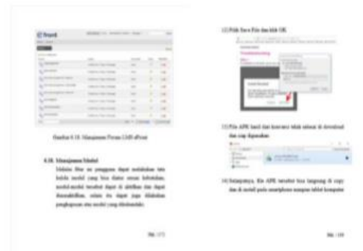
Figure 2. Text Matter