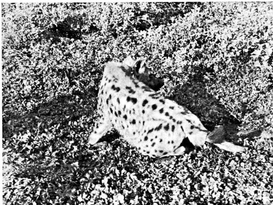
Fig. 1. An adult spotted hyaena disturbed while recovering from Ketamine anaesthesia. Although paresis of the forequarters is noticeable, the hind-quarters remained parietic for a greater length of time. The tail has been cropped for identification purposes.

As was the case with lions (Smuts et al. , 1973) the depth of anaesthesia and analgesia could be regulated at any stage by administering intravenous or intramuscular booster doses of Ketamine.