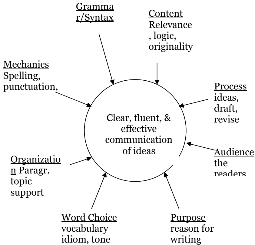
Figure 1: Adapted from Ann Raimes (1983)

can be learned in a nice order”. The following diagram shows how writing skill involves many aspects: