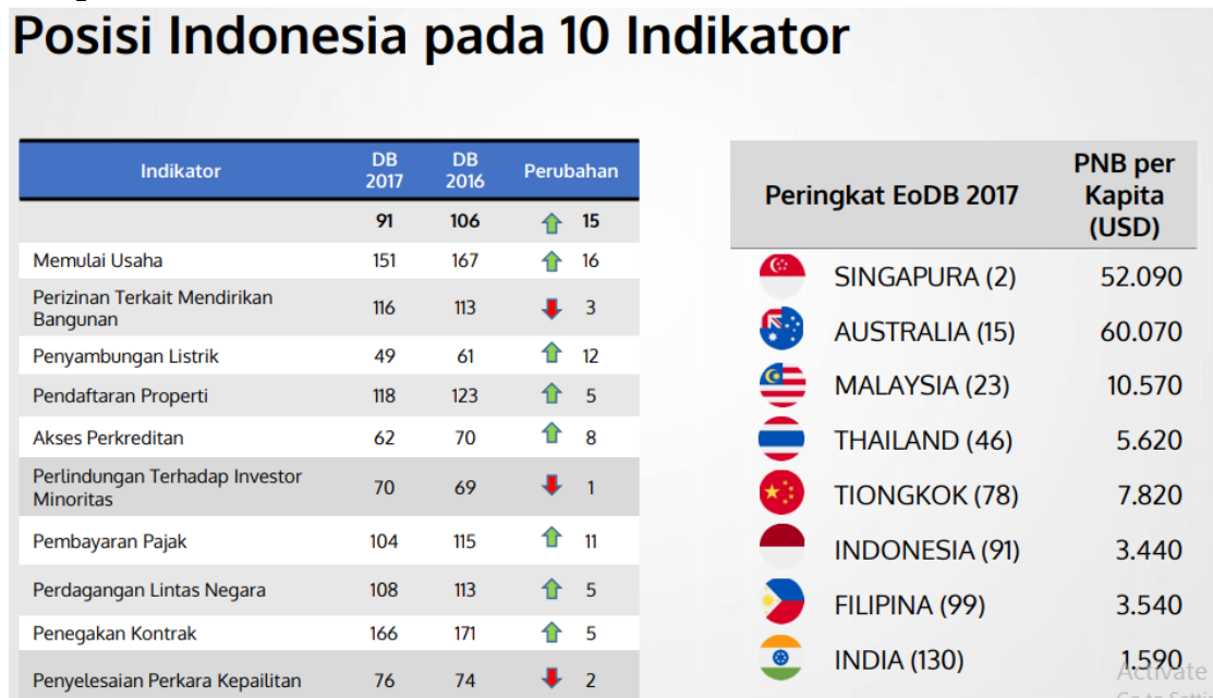
Figure 1.2. Indonesia's Position on EODB's ten indicators

Thus, the elimination of the minimum amount removes any legal protection for third parties.