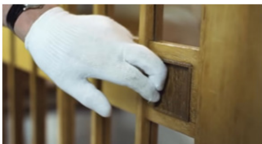
Figure 2 A Close-Up Shot of a Hand Opening a Door (Gelb, 2011)

To understand the shared meanings of the sushi culture through the concept of shokunin , it is imperative to look at the contribution of the film elements: cinematography and mise-en-scène . Visually, the film frames the consumption and production of sushi efficiently and directly through the two film elements. The film opens in a series of slow-motion shots showing a hand wearing a glove opening a door, then the shot changes into a shot of the gloves being taken off and then shifts to a shot of a small sushi restaurant (Figures 2 to 4).