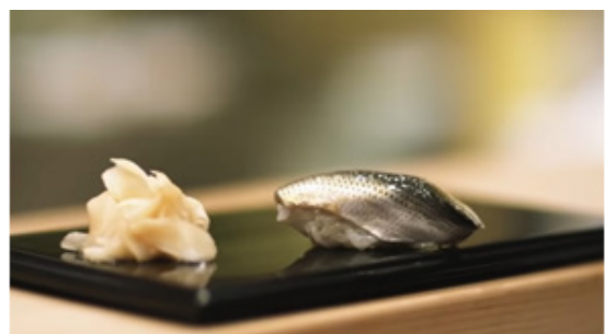
Figure 5 A Close-Up Shot of a Sushi (Gelb, 2011)

The first three shots (Figures 2 to 4) provide an important clue to the audience: the significant role of hands in producing sushi. The art of sushi-making undoubtedly requires the finesse of the hands. The gloved hand symbolizes hard work as it refers to hands that work. Figure 4 shows that the restaurant represents the ‘sushi world’ where sushi chefs produce and showcase their ‘art’ for the customers to appreciate and consume. From the element of cinematography, the film uses many close-up shots. Close-up shots give more intimacy between the object and the audience because the expressions and emotions are visible when the object is people, and they give details in texture and often raise appetite when the object is a thing such as food (see Figure 5). Close-up shots also psychologically increase viewer cognitive empathy (Lankhuizen et al., 2020). In this way, the film manages to draw the audience to feel involved in sushi production.