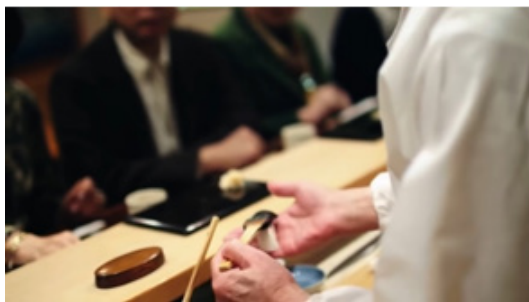
Figure 8 Jiro Ono “Performs” in Front of his Customers (Gelb, 2011)

The second aspect is the consumption of sushi. While the audience thinks that consuming sushi is just like consuming any other food, Jiro, as a shokunin , delivers a different message on how eating sushi means more than just putting sushi in the mouth and swallowing it. In the spirit of shokunin , Jiro explains that consuming sushi requires certain rules and rituals, including discipline and harmony. The customer is to eat the piece of sushi in one bite; biting it in half or leaving some is not acceptable, and it is to be eaten within seconds after the chef serves it in front of them (Holt & Yamauchi, 2019). Even the process of reserving a table requires patience and a long wait; customers are required to reserve months before eating at Jiro’s restaurant (Sukiyabashi Jiro) in Ginza. The fact that the restaurant only seats ten people signifies that profit is not the main purpose of Ono.