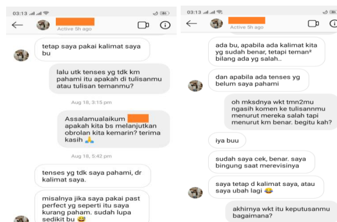
Picture 2 Interview with S10 through direct message (DM) that told about her disagreement of her peers' feedback comments for her narrative compositions

In terms of solving problem when analyzing their own compositions, both students (S10 and S11) fulfilled four out of five criteria as an IDEAL. Both of them realized they made mistakes after re-reading their own compositions. Therefore they tried to revise them themselves. Another reason was because they disagreed with their peers' comments/ feedback. They claimed that some of the tenses used in their compositions that their peers stated as incorret tenses were actually the correct ones. Therefore, they did not revise based on their peers' feedback comments. Here is one of interview parts with S10 through DM that stated her disagreement for her peers' feedback comments: