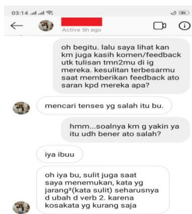
Picture 1 Interview with S10 through direct message (DM) about her solving problem experiences in the process of analyzing her peers' narrative compositions

Below is one of interview parts with S10 through direct message (DM) in explaining difficulty she encountered when she had to solve problem in the process of analyzing her peers' composition: