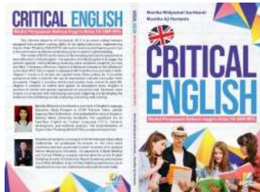
Figure 4. Critical English Textbook

Information, Simple Present Tense, Descriptive Text, and Procedure Text. Figure 5 is the look of Critical English textbook.