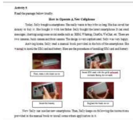
Figure 2. Sample of Activity in “Critical English” Textbook

every chapter with another one. Picture 2 is one of the examples of activity in the "Critical English" Textbook.