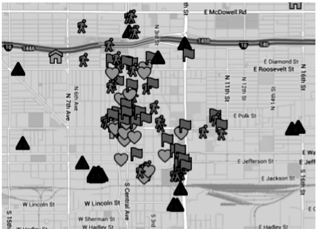
Figure 2. The Notable Places of Downtown Phoenix

Also to be expected, the heart of downtown Phoenix seemed to yield consistent answers within a dense area of the map. The heart was found within the Downtown Phoenix