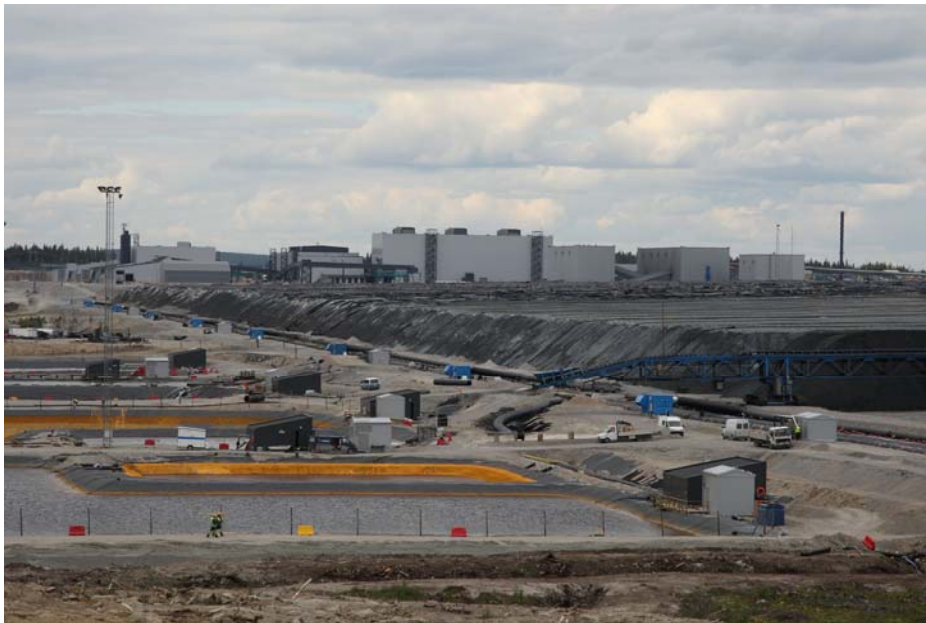
Fig. 2. PLS ponds, bioheap and metals plant

and screening and is agglomerated for bioheapleaching. At this stage of leaching no inoculum from a bacteria farm is added. Agglomeration takes place in a rotating drum, where PLS is added to the ore in order to consolidate the fine ore particles with coarser ore particles. This preconditioning step makes the ore permeable to air and water for bioheapleaching. After agglomeration, the ore is conveyed and stacked eight meters high on the primary heap pad for one and one-half years of bioheapleaching. The heap pad is equipped with piping, laid on the bottom of the pad, through which low-pressure fans supply air to the stacked ore. From the top, the heap is irrigated with leaching solution, which is collected from the bottom of the heap. A ten percent side flow is taken for metals recovery and the rest of the solution is diluted with pure water in order to keep the amount of solution constant.