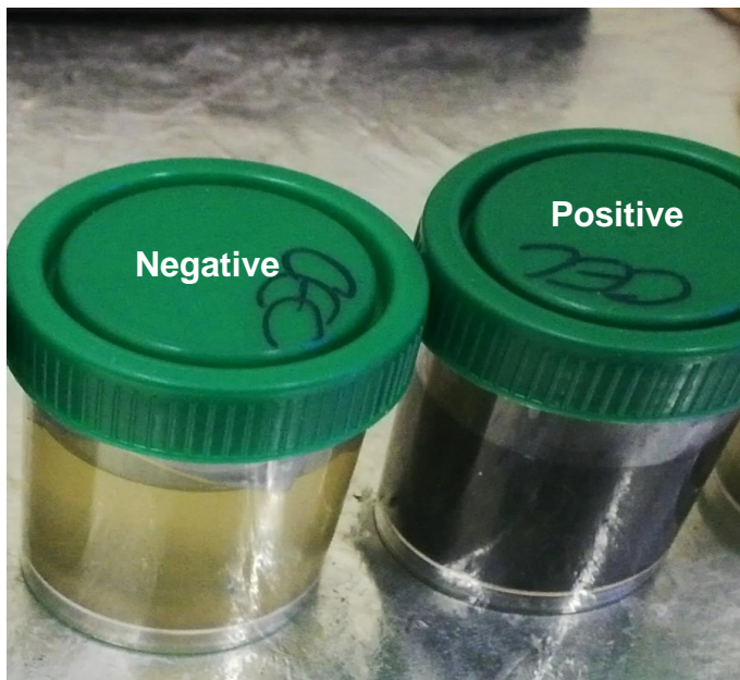
Fig. 1. Modified H 2 S kit on model samples indicating negative (left) and positive (right) results. These were used as a reference to evaluation of the individual kits collected throughout the study at sampling sites S1-S11 (Table 1).

of the H 2 S test kit in the detection of faecal contaminants compared to two standard methods (Colilert ® and MFT). Correspondence between the standard indicator microorganisms are shown in terms of presence and absence in Table 2. Fig. 1 shows the difference between a negative and a positive H 2 S test kit. The CR values and related parameters of comparison between the H 2 S test kit and the standard indicators microorganisms are shown in Table 3.