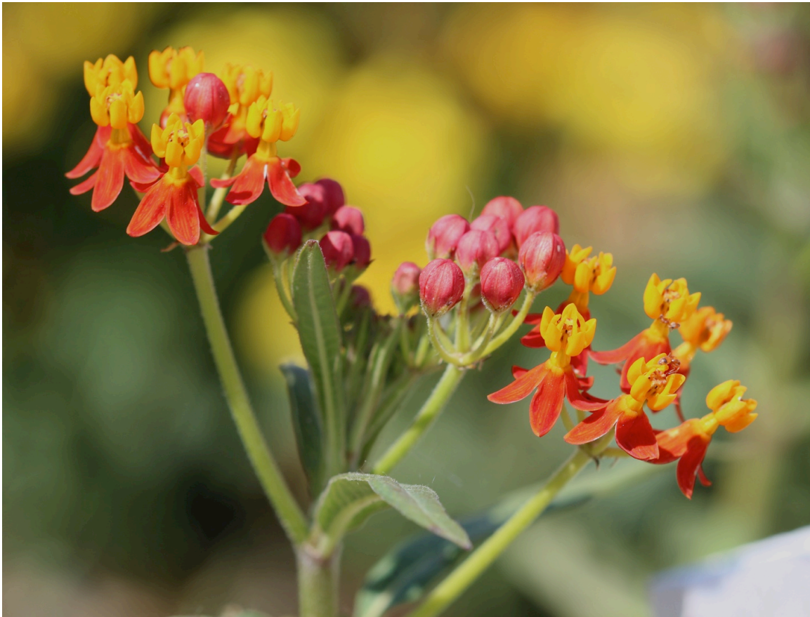
Figure 1 Tropical milkweed, Asclepias curassavica , a non-native species, is a popular plant to grow in Oklahoma and other southern states because it is easily cultivated, with a long blooming season of strikingly bold flowers. Not only is it a showy addition to gardens, it also is a host plant for the monarch butterfly caterpillar. However, our research suggests that late summer and fall availability of A. curassavica may be detrimental to migrating monarch butterflies.

migratory behavior of the species (Tenger-Trolander et al. 2019). Asclepias curassavica is a non-native species that, when grown in Oklahoma, blooms late into the fall, retains healthy vegetation until frost, and does not fully die back until the first hard freeze. In contrast, by late summer, vegetation of native Asclepias species is often old, tough, or senesced and generally not suitable as a food source for monarch larvae (Zalucki and Kitching 1982, Baum and Sharber 2012).