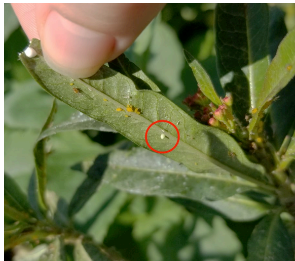
Figure 4 Monarch butterfly egg, circled in red, on the underside of an A. curassavica leaf (yellow aphids can also be seen to the upper left)