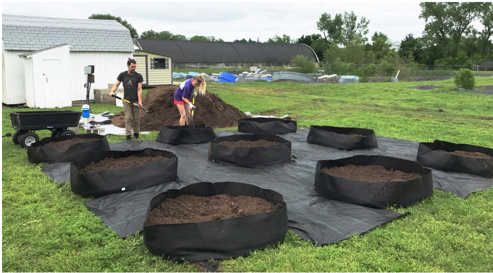
Figure 2 Circular fabric raised beds (1.25 m diameter x 0.3 m tall, Smart Pot® www.smartpots.com ) were filled with commercial topsoil and arranged in a 3 x 6 grid with landscape weed barrier fabric between beds. The research site, on the edge of an urban area, has natural habitat within 0.25 km of our raised beds.

monarchs need 24 days to mature from egg to adult (Zalucki 1982). Development of larvae is generally slower during the cooler fall conditions. In 2019, our first freeze occurred on 12 October and more than half of the eggs were laid after 12 September. Consequently, the majority of monarch eggs had insufficient time to mature before the first freeze.