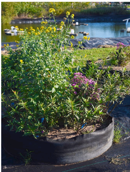
Figure 3 Raised bed of A. curassavica and nectar plants in bloom on 27 September 2019