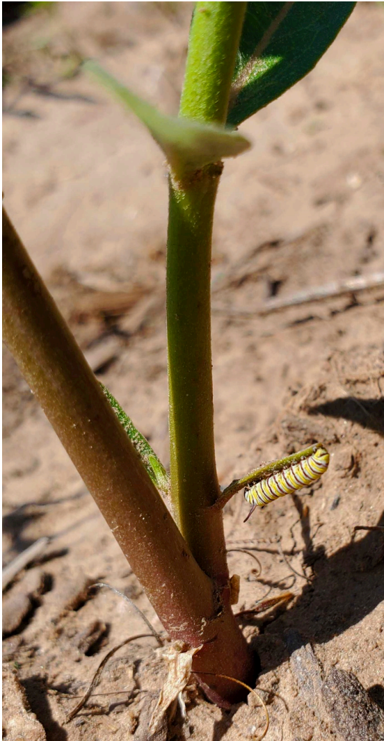
Figure 5 Third instar monarch caterpillar on the lowest leaf of one of 48 A. curassavica plants in the research beds