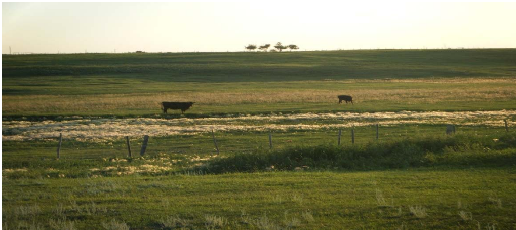
Figure 1: “[The doctors] know us...[They] have farms here.”

For their part, the students—even those from rural backgrounds—were struck by the democratizing, community ethos of the rural health care team. “In [the city], we never really got to talk to the physio [therapists], or occupational therapists, or social workers, and here... everyone works together. It’s really refreshing.