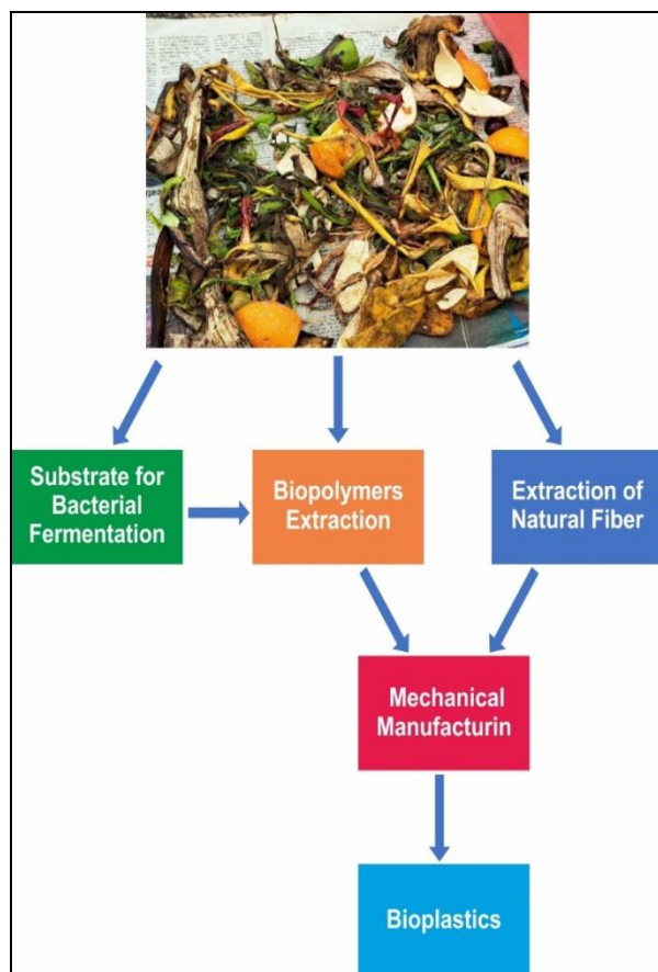
Figure 1. Process of bioplastic from kitchen waste

isocyanates react to create PU. Vegetable oil, cashew nutshell liquid, cellulose, lignin, and protein are only some of the renewable resources that may be used to create bio-based polyols alongside petroleum-based polyol [22]. Polyols can have different traits depending on the biomass and how they are processed. The melted result is a mix of polyols that can be used right away to make foams, glues, and films [23].