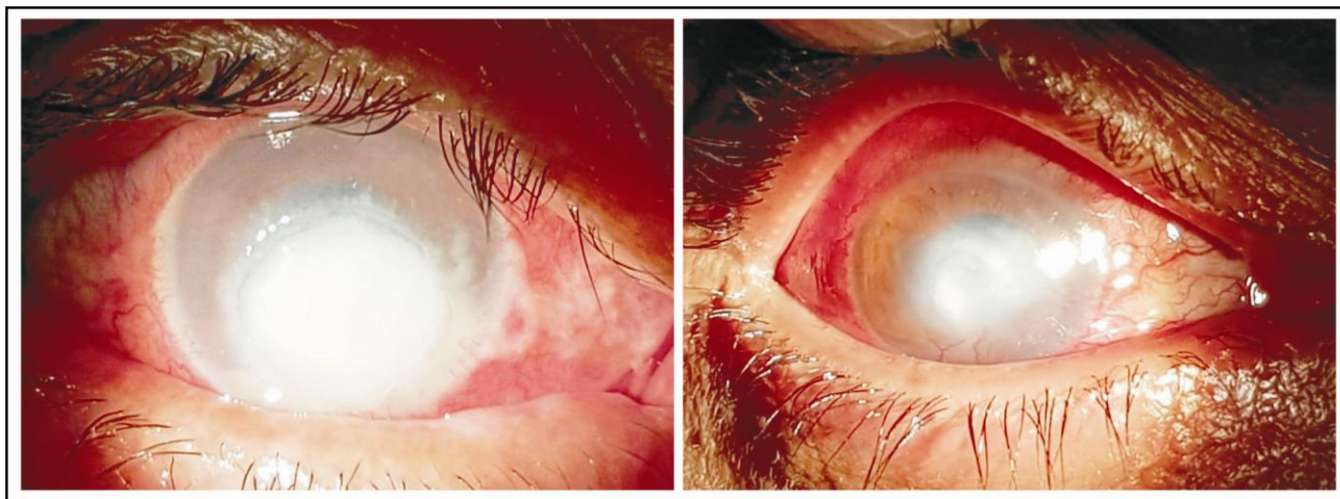
Fig. 1: Corneal Ulcer Before (Left) and After Treatment (Right).

Sixty four patients were selected, fifty five were males and nine were females. Mean age was 32 \pm 8 years and age range was 18 to 60 years. Corneal scrapings were sent to lab for 10% KOH staining. Only 37% showed positive staining and 63% were negative. Fifty six patients (88%) responded well (47 males and 8