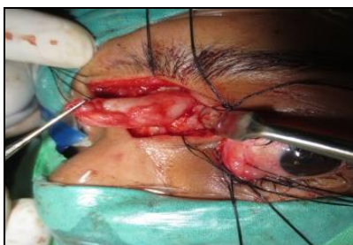
Fig. 4: The tumour being removed.

These findings gave the impression of a mass involving the medial rectus. Surgical excision was performed under general anesthesia. Lynch Howarth approach was used. The excised mass which was yellowish in colour unlike the medial rectus on naked eye examination was excised and wound closed with 6/0 vicryl (Fig 4). But the medial rectus tendon was forming the anterior end of the mass which suggested that the muscle had lost its characteristic appearance due to pathological changes. The tendon was identified and separated from the sclera with a muscle hook before excision. Biopsy specimen was sent for histopathology (Fig. 5).