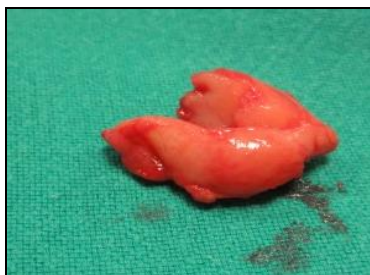
Fig. 5: Biopsy specimen.

On a follow up examination, 2 weeks after surgery, proptosis was decreased to 20 mm. Optic disc, anterior and posterior segments were within normal limits. Intraocular pressure was 16 mm Hg. Inward eye movements were restricted (grade -4), but normal on superior, inferior and lateral gaze (Fig. 6). There was no diplopia.