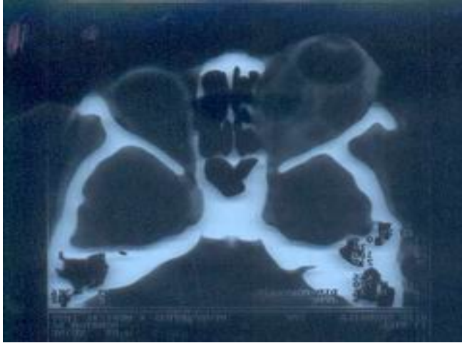
Fig. 2: Axial view - showing multiple intraconal cystic lesions