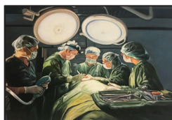
"Surhano" Acrylic on Canvas 24x36 By Angelito R. Lepalam 2017