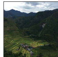
"Philippine Banaue Rice Terraces" Setting: Photo Apple iPad mini 3 Model No. MGJ22PP/A Software version: 12.4.2 By Rowena C. Saplala