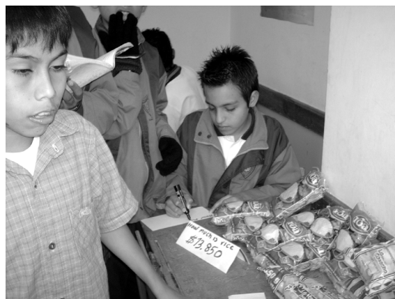
Picture 2. Sixth graders getting prepared for the role play At the store .

Concerning language, I could see that the students showed significant progress in their English language use; one important finding deals with vocabulary increase as a result of class interaction and task-based learning; in general, students liked the kind of activities conducted in the observed lessons and they enjoyed expressing their own likes, views, and creativity; that is, working with meaningful tasks that made them use the language for real communication.