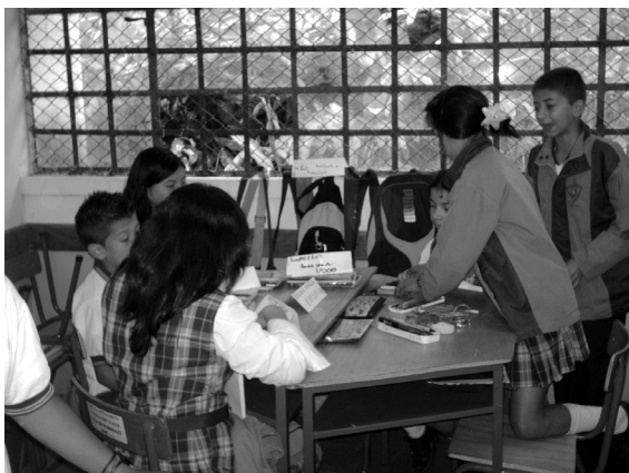
Picture 1. Class distribution in the Escuela Activa Urbana model.

The groups talked among them while the teacher tried to give instructions.