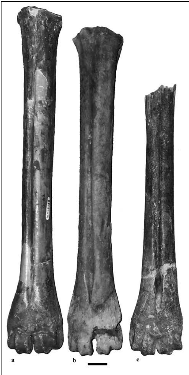
Fig. 2 - Metatarsi from Selvella (IGF14158) (a) Eucladoceros from Upper Valdarno (b) and Madonna della Strada (DESSR s.n.) (c) in dorsal view. Scale bar = 2 cm.

relatively large and the posterior articular surface with the cubonavicular is elongated and oblique. In the metatarsi from Selvella and Madonna della Strada, the dorsal longitudinal groove seems to be relatively marked in dorsal view, and ends in parallel edges. In the same view, in the distal epiphysis the gap between the trochleae appears relatively enlarged and with parallel edges. The length of the metatarsus from Madonna della Strada, from the distal articular surface to the broken area, is about 295 mm. The broken area is at the beginning of the posterior tuberosity on the medial posterior side of the bone (in correspondence to the beginning of the maximum anteroposterior diameter of the medial side).