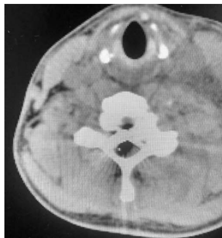
Figure 1 - Cervical spine CT scan showing Pneumorrhachis at the height of C7

A 40-year-old male patient with no morbid history. Presenting trauma in the lumbar region with forceful object, evaluated by neurosurgery, is performed lumbar CT scan that as a pathological finding was observed Lumbar spine CT scan showing evidence of Pneumorrhachis at the level of L3 (Figure 3). The patient was managed conservatively. He was sent home at 48 hours.