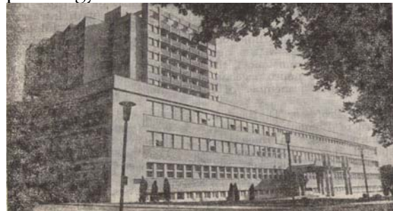
Figure 4 Clinic of Neurosurgery Bucharest, 1975

Under Professor C. Arseni (Figure 3), the Neurosurgical Clinic of Bucharest is transformed in 1975 into the "Prof. Dr. D. Bagdasar" Clinical Hospital of Neurosurgery, the largest hospital of neurosurgery in Europe, with 550 beds and, subsequently, 650 beds. It appears as a crowning and a confirmation of the value of neurosurgery within the framework of medical specialties. Conceived and built according to carefully skilled and daring plans, the new Clinic of Neurosurgery is structured in seven clearly separate clinical departments, including also a pediatric neurosurgical department. In the Neurosurgical Clinic there is an independent ICU department with 26 beds. The operatory activity is carried out within two operating theaters with 13 operating rooms. The simple mention of the services within the Neurosurgical Clinic founded in 1975 (Figure 4), reflects just a little the reality. Practically in this clinic is managed the surgical pathology of the expanding intracranial processes, the cerebrovascular surgery, the tumoral surgery, vertebromedullary trauma and degenerative pathology, head injuries, the surgery of epilepsy and dyskinesia, pediatric neurosurgical pathology, peripheral nerves surgery and, as a special element, the neuro-orthopedic pathology.