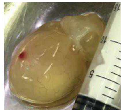
FIGURE 2. the delivered intact hydatid cyst.