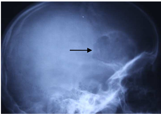
Figure 1 - shows calcification in right temporal region (black arrow)

1). At our hospital CT scan head was done which revealed right temporal extradural heterogenous lesion with calcified walls (Figure 2). Craniectomy with excision of underlying bone and evacuation of hematoma was done. Liquefied altered blood with thick hard calcified walls adherent to duramater was present. On Histological examination of the specimen chronic ossified hematoma full of blood mixed fluid was confirmed. Patient was discharged on seventh postoperative day. Cranioplasty was done after six months by using bone cement.