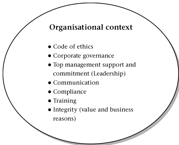
Figure 1: Context for organisational transfer of code of ethics