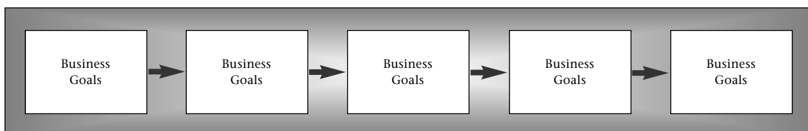
Figure 1: A model for linking business goals with individual and organisational performance (from Gratton, 2000, p.10)

In this model, business goals are defined and the context for people to perform is developed. Employees' behaviour determines the meeting of business goals, influencing organisational performance, and ultimately financial