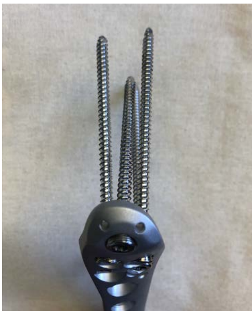
Figure 4. Proximal femur locking plate top view

cut-out, lateralisation of proximal fragment and varus collapse. Adductor muscle pull tends to medially displace the distal fragment in unstable intertrochanteric fractures and a PFLP resists this deforming force. The locking mechanism in a PFLP creates a non-collapsing implant which overcomes the forces that otherwise develop at the screw-plate junction in a DHS with coaxial collapse of the proximal fragment. Bone preservation is an important factor for fracture union, and the PFLP is superior to the DHS in this respect owing to the smaller screw size. 34