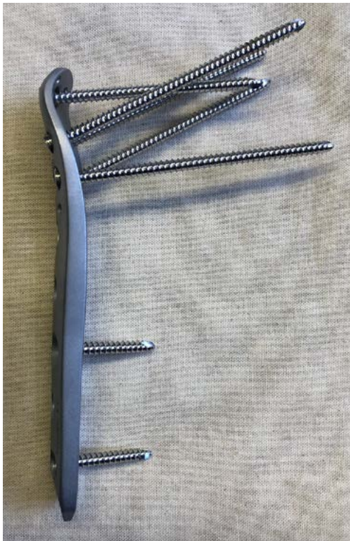
Figure 3. Proximal femur locking plate side view