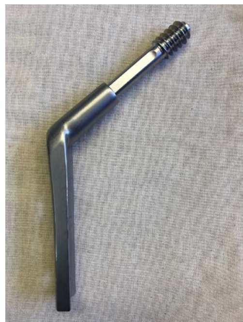
Figure 2. Dynamic hip screw

The proximal femur locking plate (PFLP) is another extramedullary device for intertrochanteric fracture fixation ( Figure 3 ). It is a fixed-angle, static construct and the plate offers lateral wall buttress. A precontoured design enables anatomical reduction and fixation against the plate, and the convergent proximal locking screws enhance fixation stability ( Figure 4 ). 33 Advantages versus the DHS in unstable fractures are that it can address complications like shortening, medialisation of the distal fragment, implant