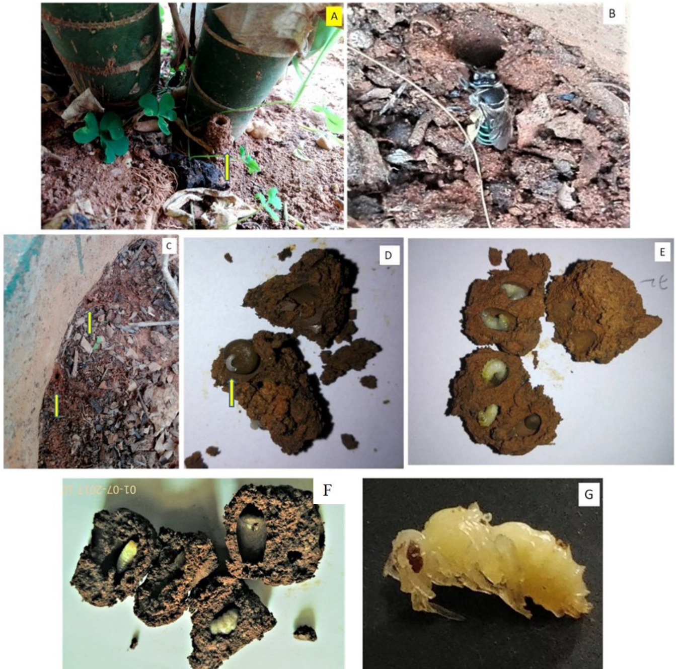
Fig 2. A. Nest Turret; B. Female bee visiting the nest; C. Multiple entrance of the nest; D. Egg; E. Different larval stages; F. Late larva and Prepupa; G. Pupa.

seasonal incidence and activity of the bee is influenced by the phenology of flowering plants and their diversity, land use and nesting suitability (Shebl et al., 2016). Availability of an appropriate seasonal floral base that provides nectar and pollen to the foraging bees is vital for the survival and reproduction of the bees. The frequency of a particular flower visitor in the target crop is an important factor that determines its efficiency in pollination of that crop.