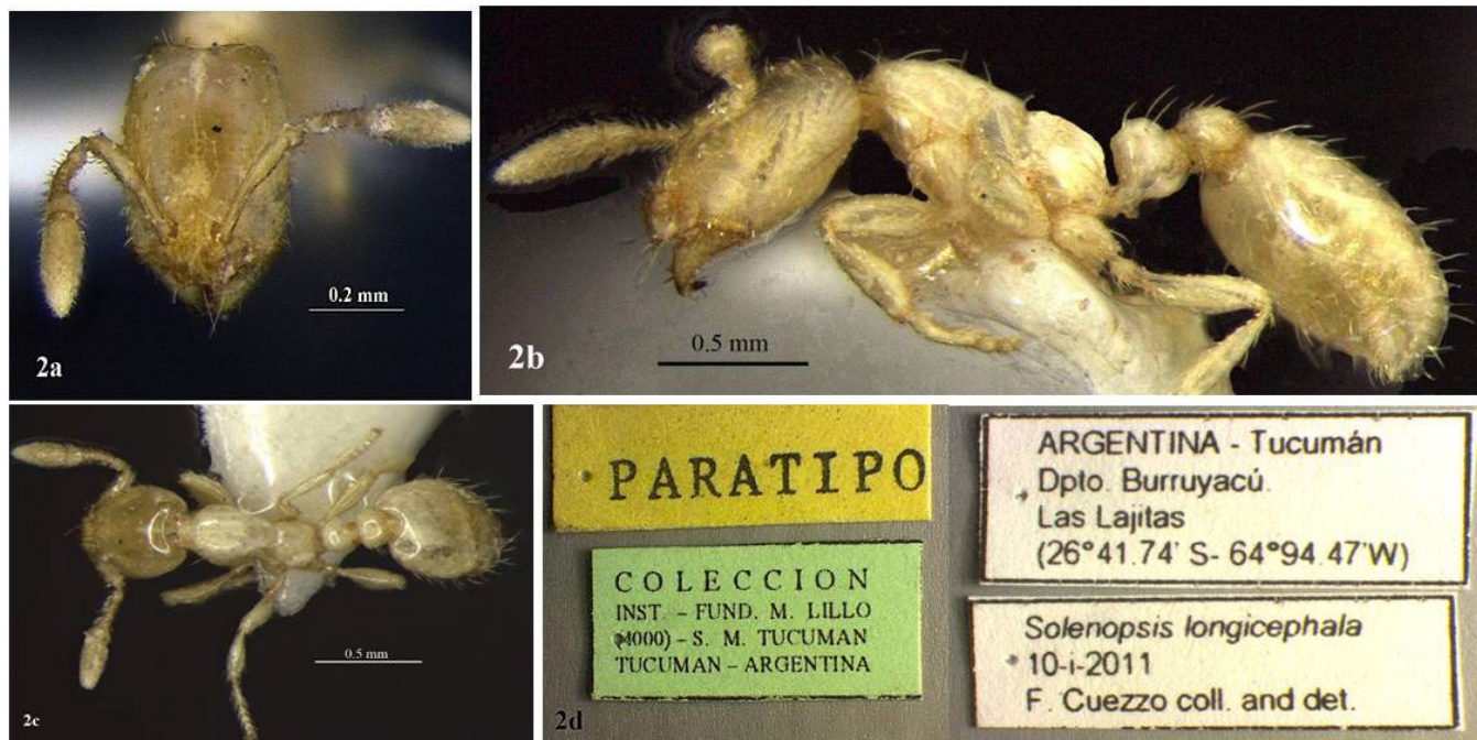
Fig 2a-d. Habitus of Solenopsis longicephala sp. n. minor worker: a - head in full-face view; b - left side of body, in profile; c - dorsal view of body; d - Paratype labels.

Distribution. Known only from the type locality.