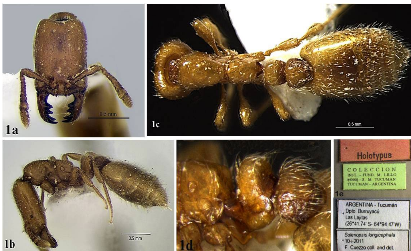
Fig 1a-e. Habitus of Solenopsis longicephala sp. n. major worker: a - head in full-face view; b - left side of body, in profile; c - dorsal view of body; d - petiole and postpetiole, lateral view; e - Holotype labels.

Type data. Holotype major worker: Argentina, Tucumán, Dpto. Burruyacú. Las Lajitas (26° 41.74' S- 64° 94.47' W) 10-i-2011, F. Cuezco coll. (deposited in IFML). Paratypes (same data): 10 major workers and 10 minor workers (deposited in ICN), 5 major workers and 10 minor workers (deposited in MZSP), rest of the series (n= 33 major workers and 439 minor workers) deposited at IFML.